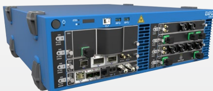
LTB-8 EIGHT-SLOT RACKMOUNT PLATFORM

WINDOWS ENVIRONMENT | BUILT-IN APPLICATIONS | THIRD-PARTY APPLICATIONS SCALABLE | HOT-SWAPPABLE MODULES | USB